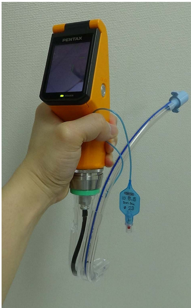
Figure 1 Photograph of Airway Scope AWS-S100L (Pentax Corporation, Tokyo, Japan).

We retrospectively analysed data from the Japanese Airway Management Quantification (JAMQ) study. The