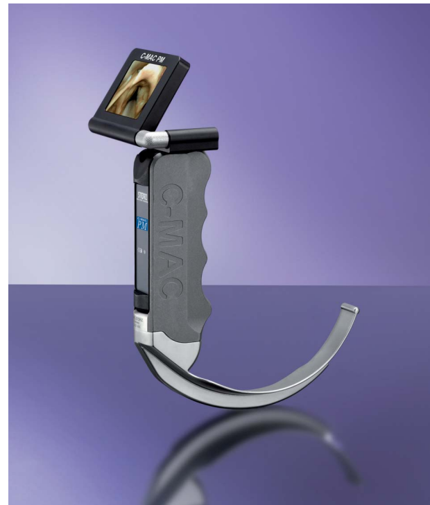
Figure 2 Photograph of C-MAC PM (Karl Storz, Tuttlingen, Germany).

JAMQ study is a prospective multicentre data registry to investigate the factors associated with the improvement of intubation skills among novice physicians (postgraduate year (PGY) 1) using a high-fidelity simulator, with all data collection planned a priori. 6 12 The JAMQ study was initiated in April 2015 as a consortium of two academic hospitals (University of Fukui Hospital and University of Tsukuba Hospital) and two community medical centres (Fukui Prefectural Hospital and Tokyo Bay Urayasu/Ichikawa Medical Center) from different geographic regions across Japan. In the JAMQ study, we examined the intubation skills every year by using both different simulation scenarios and intubation devices. The present study utilises the data collected in April 2015 (the beginning of a new term).