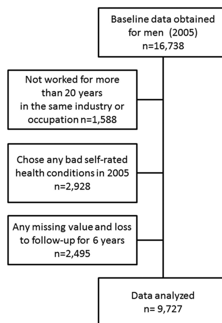
Figure 1 Flow diagram of the exclusion process.

We utilised baseline data for: occupation as contents of work (classified into 9 categories asking about their