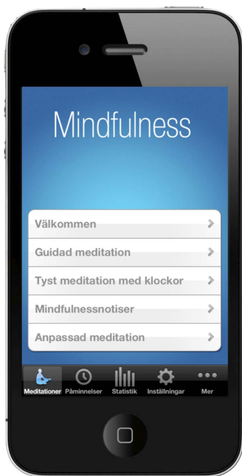
Figure 3 Screenshot of the Mindfulness application (the native version).

current treatment week, and send this reflection to their therapist via email. The participants received personal feedback on their reflection from their therapist.