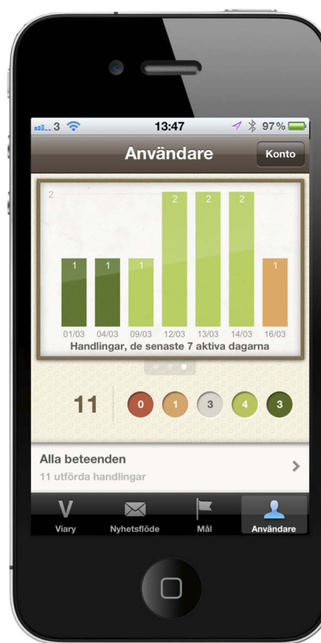
Figure 2 Screenshot of the BA application (the native version).

The smartphone application was built as a native application for Iphone, meaning that the application was coded in a specific programming language (objective C), and as a mobile web application for other smartphones. See figure 2 for a screenshot of the application. A prototype of the smartphone application was tested in a pilot study. 49 This prototype, however, was not specifically designed for depression interventions. The purpose of the BA application was to make it easy for the participant to remember and register important behaviours in order to increase everyday activation. The application contained a database of 54 behaviours, divided into three different areas for the participant to add to their application. See box 1 for the list of behaviours from the database. The database aimed to provide suggestions,