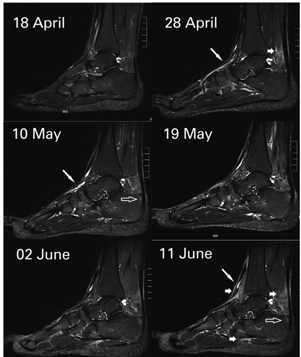
Figure 2 Subcutaneous oedema on a sagittal short \tau inversion recovery weighted MRI scan. The six dates represent different MRI measurements of the same foot of one TEFR09 participant, each with identical window settings. The long diagonal arrow points to tubular high-intensity structures, probably corresponding to peritendinous fluid. The short arrow points to subcutaneous oedema and oedema in Kager's fat pad of the Achilles tendon (AT). The translucent arrow points to intraosseous signal near the AT insertion evolving later than the subcutaneous oedema.

AT diameter and intraosseous SI as well as subcutaneous oedema. Non-finishers displayed higher rates of soft tissue oedema.