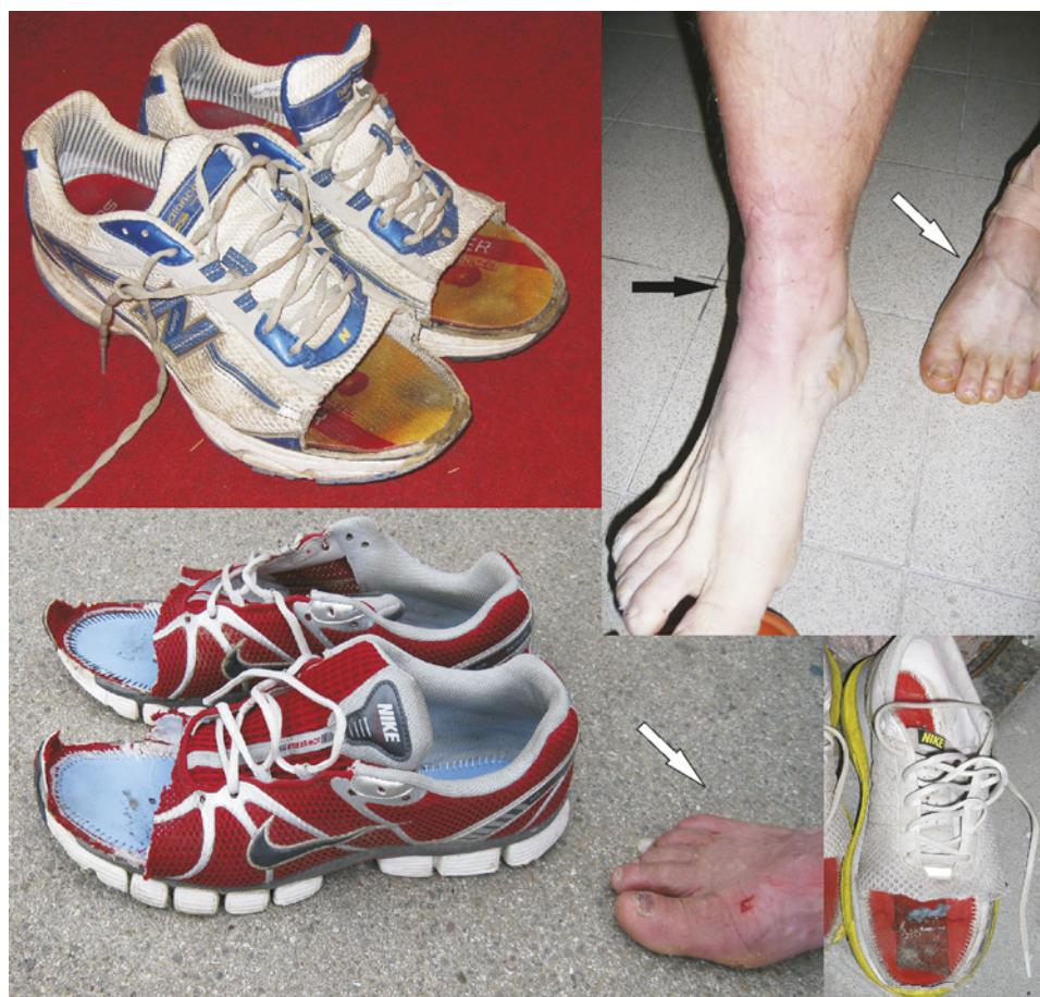
Figure 3 Makeshift sandals. Subcutaneous oedema resulting in ankle (black arrow) and foot swelling (white arrows) necessitated cutting away parts of the shoes, creating makeshift sandals to accommodate the athletes' feet.

Furthermore, gradual increases over the run in osseous signal of the calcaneus as well as the maximal intraosseous signal in any foot bone and the number of bone lesions could be shown (see figure 4).