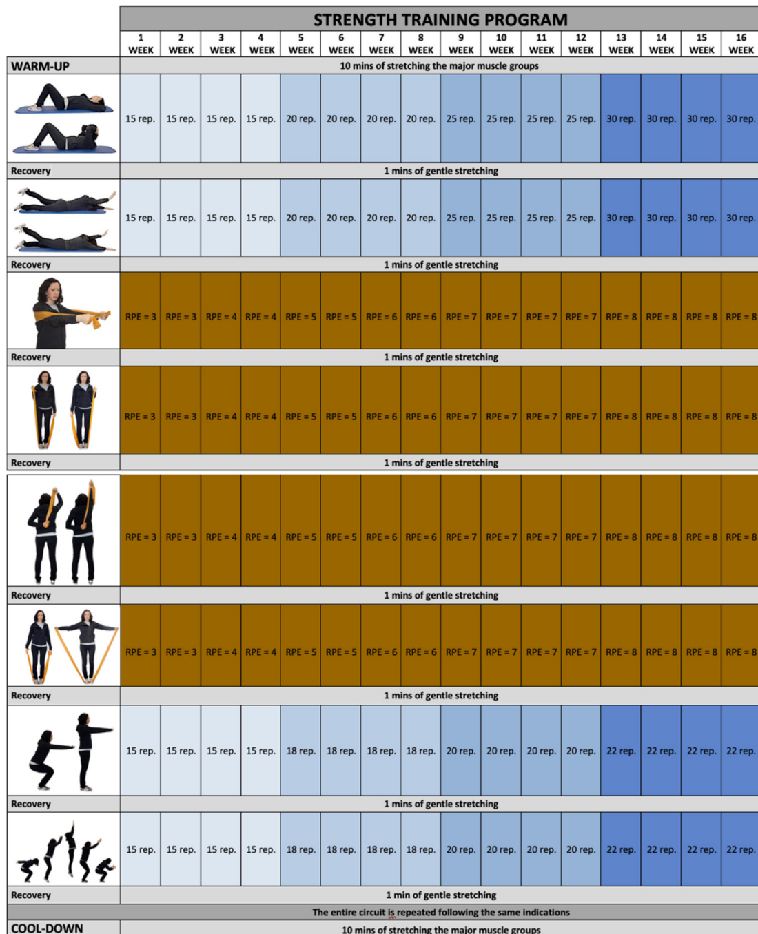
Figure 2 Strength training. Borg Rating of Perceived Exertion (RPE). rep, repetition.

and will be scheduled between 10:00 and 12:00 hours to minimise variability.