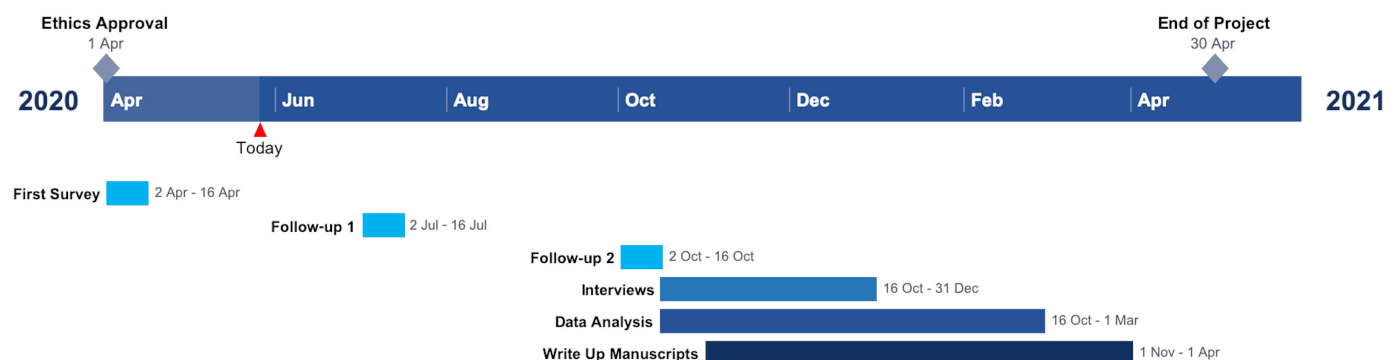
Figure 1 Project timeline.

Despite the large body of literature that is focused on the prevalence of mental health symptoms after catastrophes or natural disasters, the investigation of the resilience of HCPs is scarce, particularly in the face of a surge capacity. In disaster situations, the prevalence of resilience appears to depend on adequate preparedness, good social support and proactive coping styles. 9 However, most disaster sites do not impose social distancing and self-isolation procedures, which might further compromise HCPs' ability to cope. It has been shown before that professionals involved in disaster relief work can develop post-traumatic growth. 14 15 Establishing a clear relationship between resilience and a work-related sense of coherence with the development of mental symptoms during exceptional situations like the current COVID-19 pandemic might help to identify HCPs who are both particularly protected and at risk, which will allow adequate distribution of psychological interventions. Organisations can also potentiate resilience in their employees by ensuring that they are adequately trained. This is would be an affordable measure that can save money and resources by keeping the staff at work and avoiding sick leave.