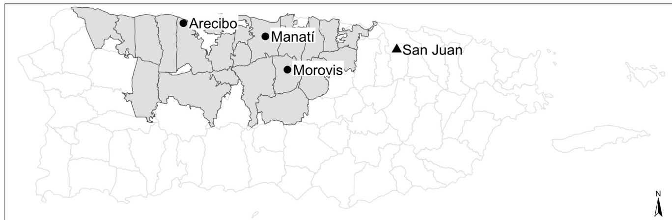
Figure 2 CRECE recruitment area and air pollution stationary ambient monitoring site locations of the three stationary ambient air quality monitors in Arecibo, Manatí and Morovis. CRECE, Centre for Research on Early Childhood Exposure and Development.

direct relevance to both the underserved population of Puerto Rico, as well as certain segments of the US general population.