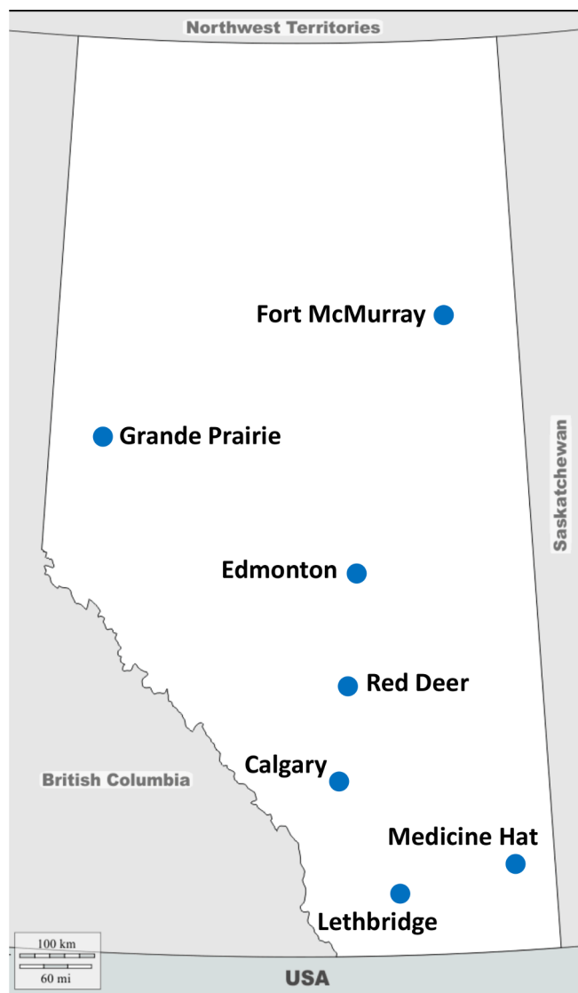
Figure 2 Alberta Cancer Exercise (ACE) programming sites.

hospitalisation), the CEP consults with the participant's oncologist or family physician on the need for further evaluation and/or referral to rehabilitation services or medically supervised exercise programming.