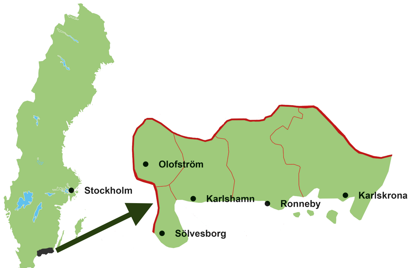
Figure 1 Location of Blekinge in Sweden, Blekinge's municipalities and main cities.

men participated in Wave 2. See figure 2 for detailed information about data collection procedure. The postal survey consisted of questions and validated instruments regarding breathing, other cardiorespiratory-related symptoms, QoL, lifestyle, new medical conditions and any treatments for breathlessness. Most questions and instruments pertained to the experiences during the last 2 weeks.