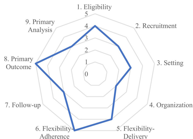
Figure 1 PRagmatic-Explanatory continuum indicator summary (PRECIS-2) wheel for the healthy lifestyles programme pilot trial design. This figure was created by reaching a consensus for each domain from four investigators on the study team using a 1–5 ordinal scale from explanatory (blue line towards the centre) to pragmatic (blue line towards the periphery). 71 Aside from the organisation domain, the PRECIS-2 wheel illustrates that the study design is closer to a pragmatic than an explanatory trial. Trial design characteristics: according to the PRECIS-2 criteria, the HLP design favours a pragmatic trial. This figure was created by reaching a consensus for each domain from four investigators on the study team using a 1–5 ordinal scale from explanatory to pragmatic. 71 (1) The eligibility criteria allows for a broadly representative population. however, those who do not speak English and/or have unstable physical or mental health concerns will be excluded. (2) Participants will be recruited from the community. (3) The trial is being conducted in a community based setting. (4) Any physician or advanced practice healthcare provider familiar with the principles of cognitive behaviour therapy and health behaviour would be able to develop goals, action plans and conduct education sessions. However, specialised providers including a dietician will be part of the trial. (5) Delivery of educational sessions and goal setting will be flexible, however, there will be some restrictions based on participant and provider availability. (6) participants will have the choice to attend as few or as many sessions as they would like. (7) Participants enrolled in the healthy lifestyles programme will be followed with more frequent visits and more extensive data collection than would occur during usual care routines. (8) The primary outcome of goal attainment will be a meaningful outcome to the study participants. (9) Due to the small sample size of the pilot study there will be no intention to treat analysis. Overall, most of the PRECIS-2 domains for the pilot study were assessed to be pragmatic, though this appraisal is potentially biased since it was conducted by investigators associated with the study. 72

criteria will include people with unstable medical or mental health conditions as self-identified or identified through the recruitment process. Fifteen participants will be recruited for each arm of the randomised trial. This number accounts for ideal numbers of people involved in small group sessions based on practice experience and for potential attrition throughout the year while allowing