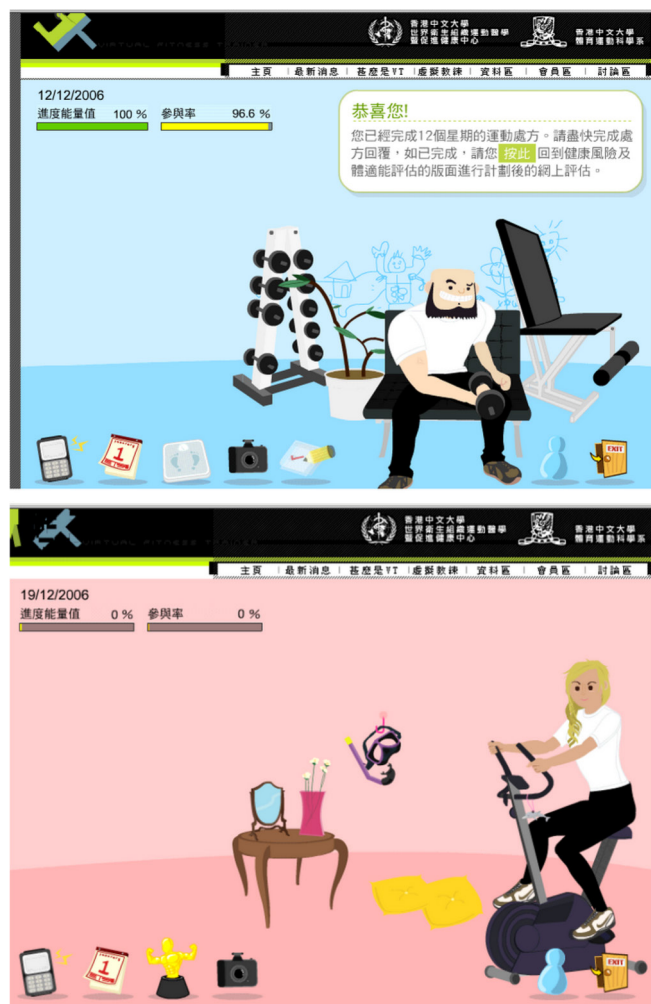
Figure 1 Screenshots of two Virtual Trainer 'rooms'.

to participants via email and short message service (SMS) to their mobile phone. These messages include reminder messages for exercise, incentive messages, positive reinforcement messages, as well as helpful tips on exercise and diet. We are now developing the third version of the VT system to allow accurate PA tracking with the integration of automatic detection and transmission of heart rate and pedometer. All this information will be updated in time through newly designed mobile Apps and transferred to an online system.