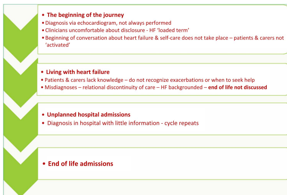
Figure 2 Points in patient pathways where risk of hospital admission is increased.

Provision of end-of-life care appeared to be compromised by clinical uncertainty, poor clinician/patient communication, lack of advance care planning and availability of appropriate resources in the community.