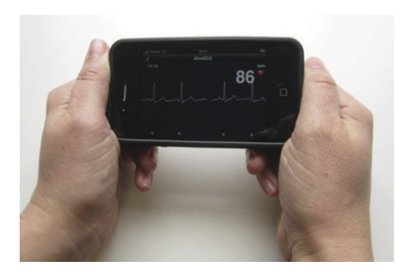
Figure 2 AliveCor iPhone ECG.