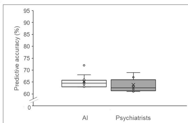
Figure 1 Comparison between our artificial intelligence (AI) model and psychiatrists of the percentage of correct answers for moderate psychological distress (K6≥5). The results of analysis of variance revealed no significant difference between the two groups ( p=0.263 ). Whiskers extend to the maximum value and minimum value. Data points exceeding a distance of 1.5 times the IQR below the first quartile or above the third quartile are shown as outliers. K6, Kessler Screening Scale for Psychological Distress.

Because of its high specificity for the prediction of severe psychological distress and because it performed better than did the psychiatrists, our trained AI model